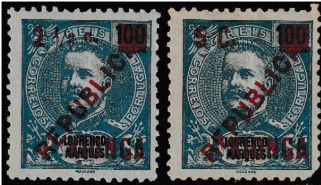
Kionga Scott 3 and 4.