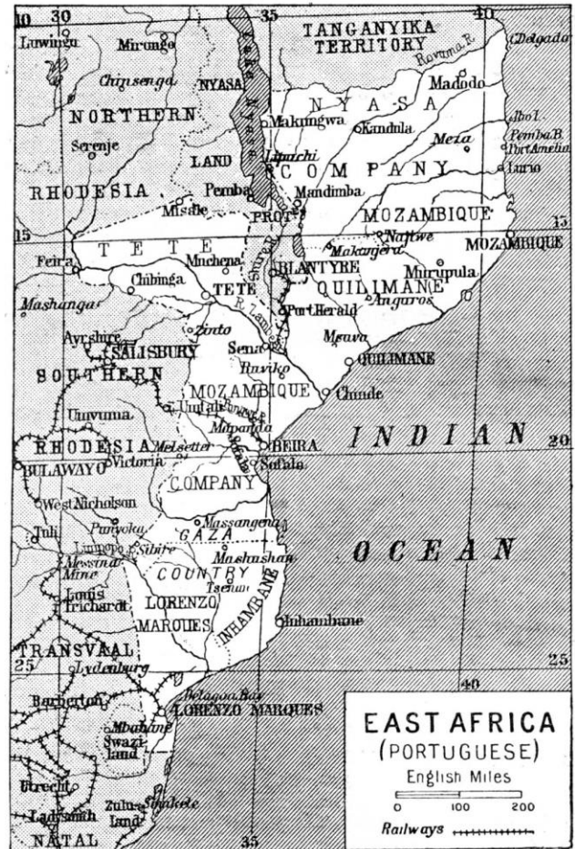
Map showing Lourenço Marques in SE Africa in the southern part of Portuguese E. Africa.

member, Jim Byrne, I learned that the process actually involved three steps. The first was to print the stamps without a country name. The second step was to print the value in black in the upper right corner and the country name in black, in the originally blank spot below the figurehead. In this case that was Lourenço Marques.