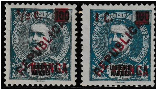
Kionga Scott 1 and 2.