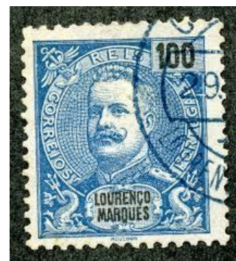
Lourenço Marques stamp prior to being overprinted for Kionga.