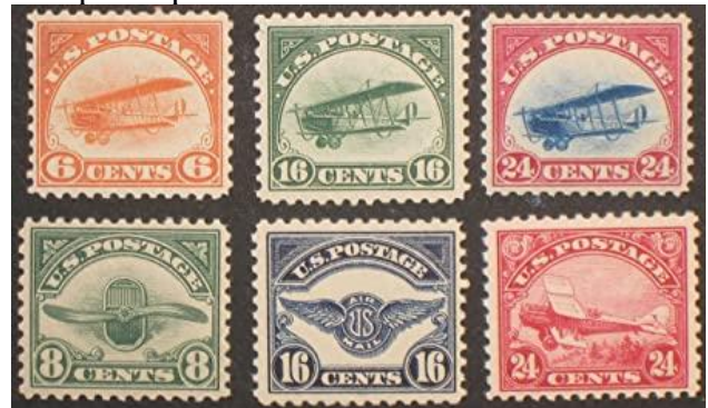
U.S. C1 to C6

This set of stamps pictured below were the first U.S. airmail stamps. Those stamps issued in 1918 were C1 to C3. They were issued to cover the airmail rate when the U.S. began moving mail through the air. Both sets of three of these stamps are pictured below.