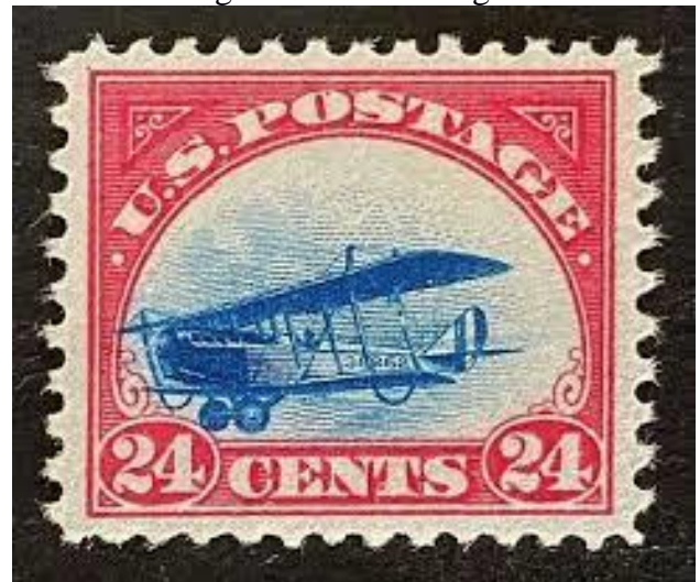
C6 blown up to better show the engraving work.

Aren’t they beautiful? I am a sucker for engraved stamps. To better view the detailed work of the engraver see the image of C3 below.