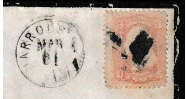
Blow up of upper right corner of above cover in an attempt to show the black edges on the mourning cover.

Let's be thankful for the rights, privileges, and freedoms we enjoy in this country