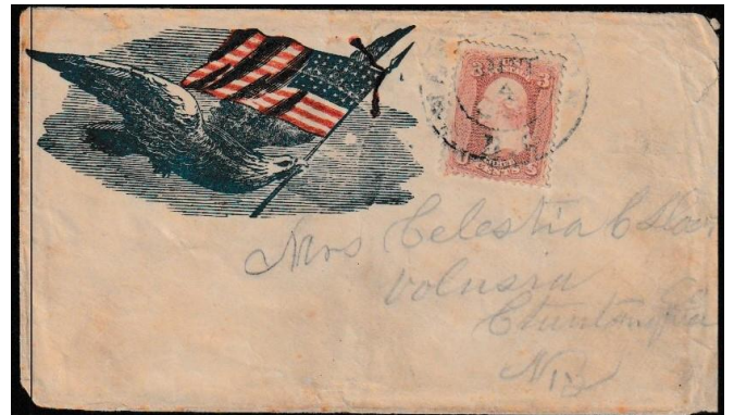
Civil War patriotic cover

The next cover I have is a Civil War patriotic cover. The cover is shown below.