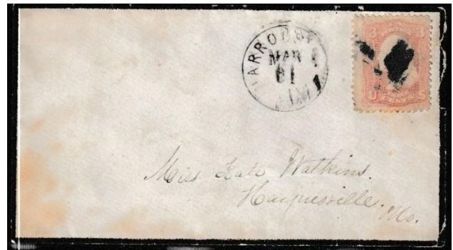
Civil War mourning cover

As we all know, the Civil War ended in victory for the north, the slaves were freed, and the union survived a very bitter trial. This mourning cover shows that many paid the ultimate price on both sides of the war.