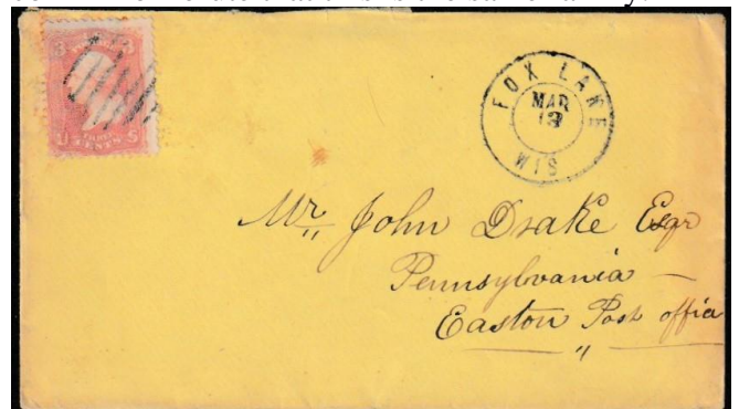
Drake Civil War cover