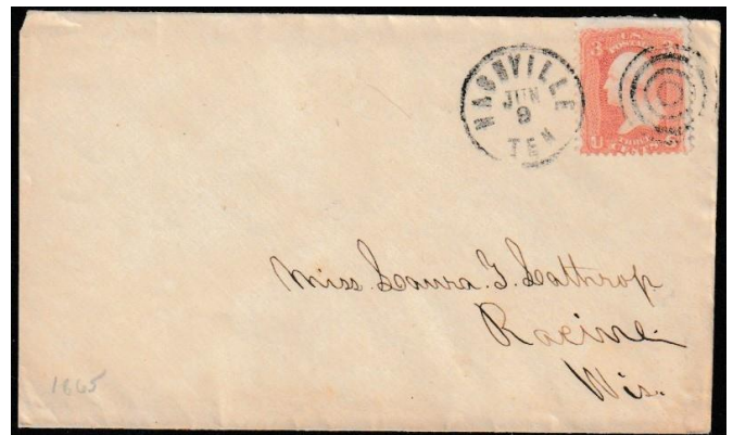
1865 cover addressed to Laura Lathrop

The next cover I have is a Civil War patriotic cover. The cover is shown below.