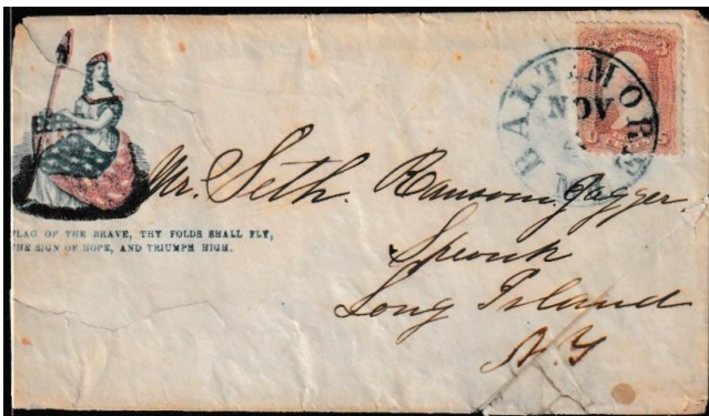
Another Civil War Patriotic cover

“Flag of the brave, thy fold shall fly, the sign of hope, and triumph high.”