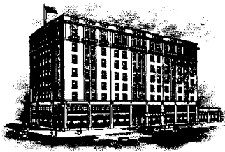
HOTEL RETLAW FOND DU LAC, WIS.